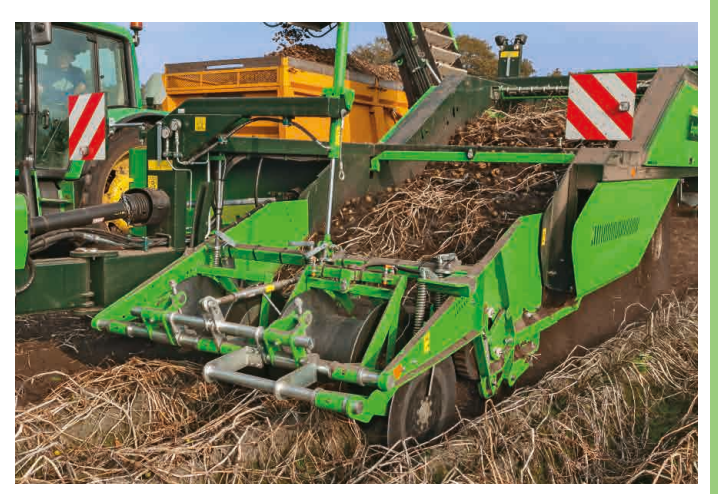
CAN-bus operation with joystick and control box