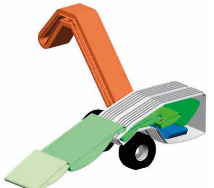
Haulm web (MC) or Haulm roller (RE)