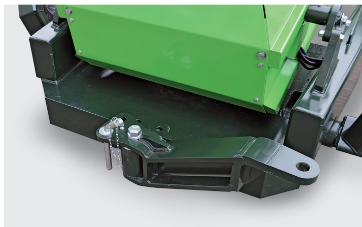
Foldable tow bar