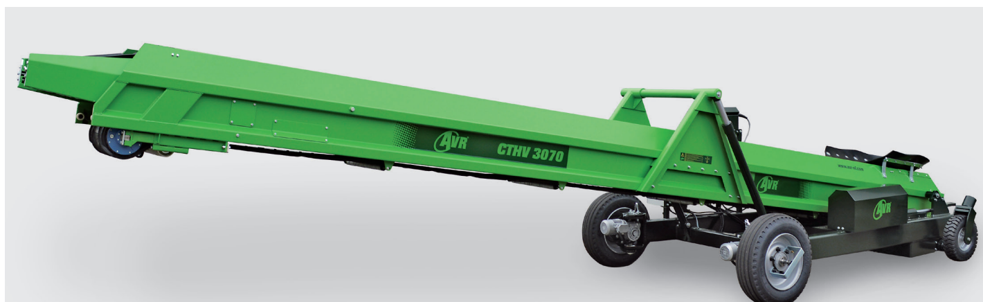
CTHV 3070 storage loader