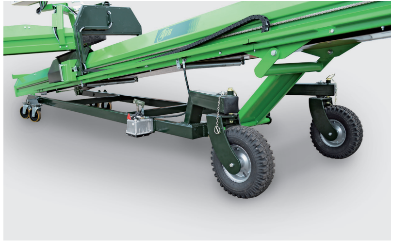
Solid frame with hydraulic height adjustment