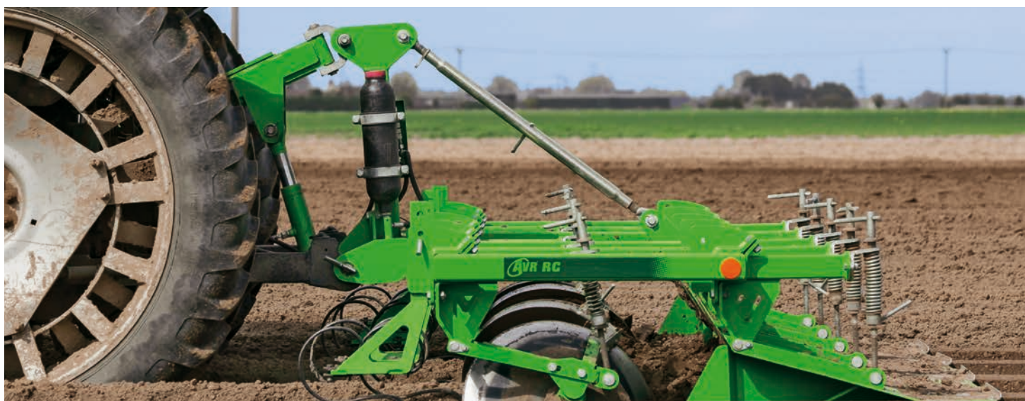
Speedridger: building the ridges