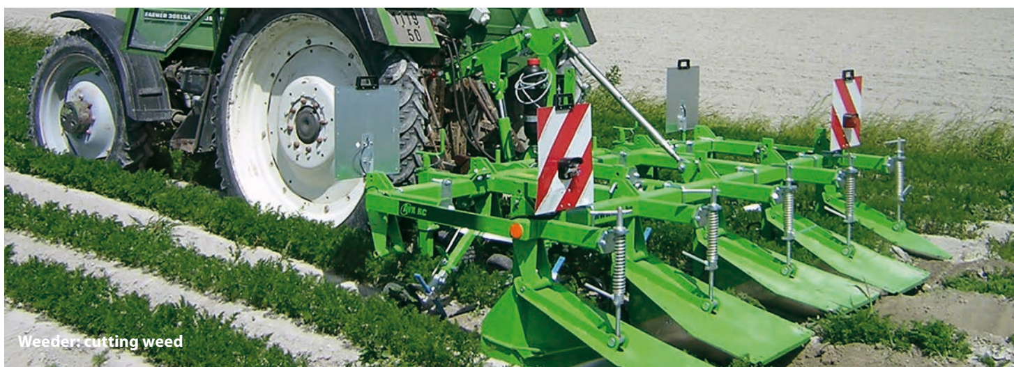
Weeder: cutting weed