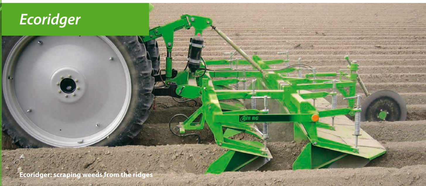
Ecoridger: scraping weeds from the ridges